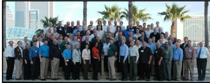
PFMI 2010 attendees on the final day.

A total of 90 private fleet professionals attended the Private Fleet Management Institute in Jacksonville January 16-20, 2010. The quality of the instruction and training generated the highest ratings ever – thanks in large part due to