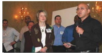
Group Case Studies

To see the full highlights of the 2010 Private Fleet Management Institute, please click here .