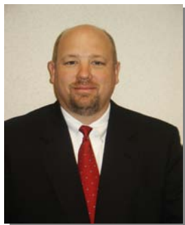
Bedford Monday, CTP

"At the end of the day, you're not judged totally on what you do, but on what your people do."