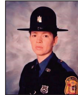
Trooper Delaware State Police Retired, 20-Year Career